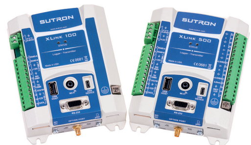
XLink 100 and XLink 500