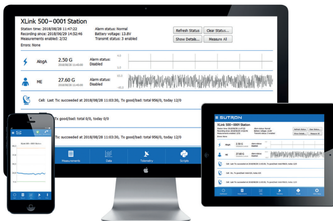
LinkComm software and mobile app