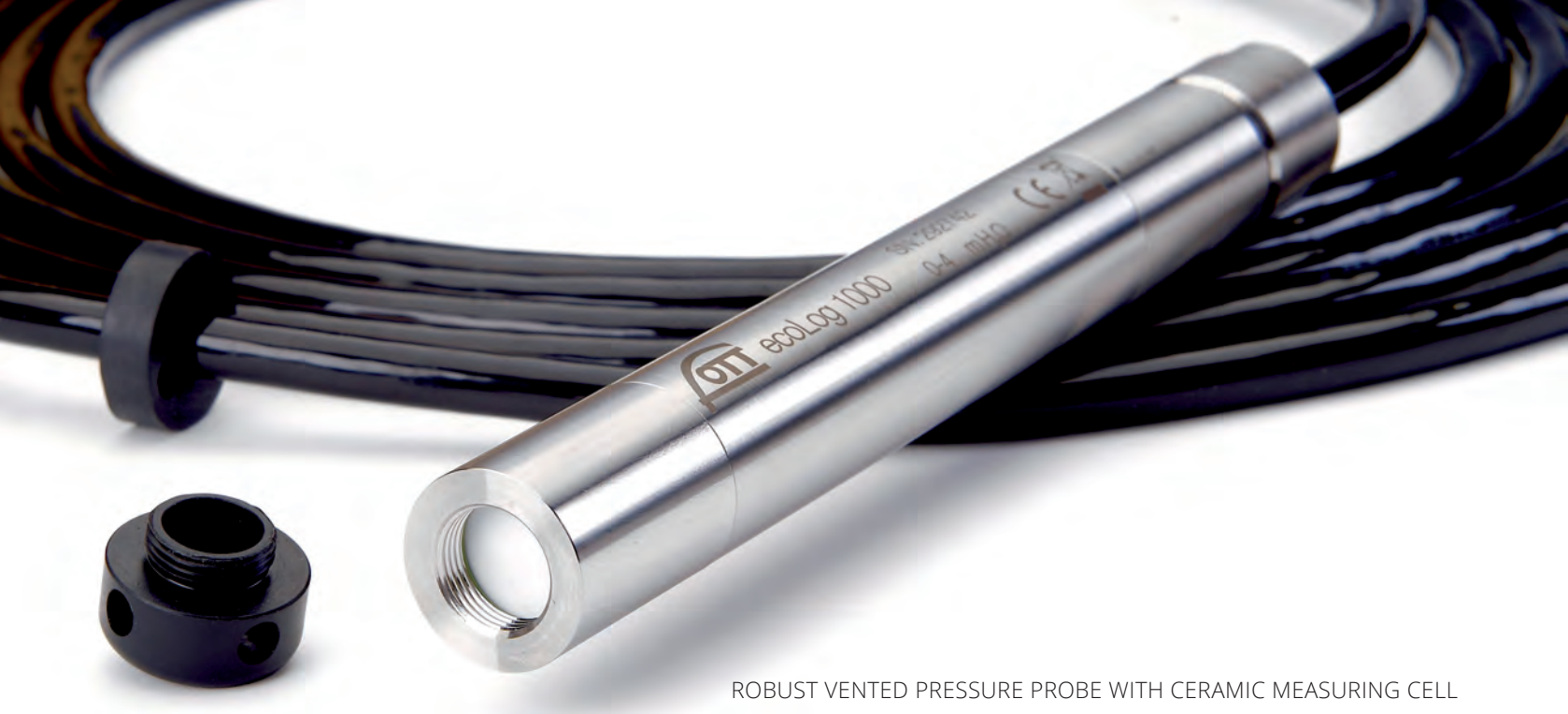
ROBUST VENTED PRESSURE PROBE WITH CERAMIC MEASURING CELL